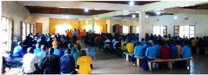
Education Motivation Programme in Hydom, Manyara Region