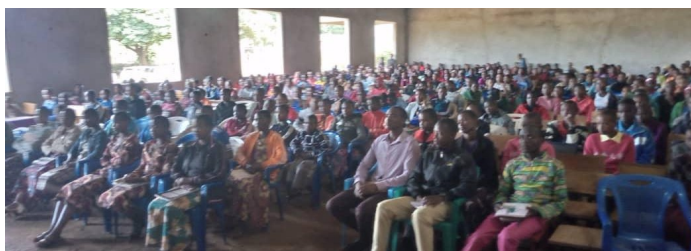
Easter conferences in Mbeya (above) and Arusha (below), among others

Despite the faulty vehicle, Isaya personally travelled to a large number of Easter conferences across the country. He reported with photos and videos of over 500 participants in some cases.