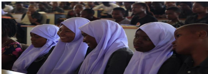
Education Motivation Programme at the University of Dodoma Students from all religious backgrounds are reached.